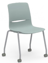
4-Leg with Casters