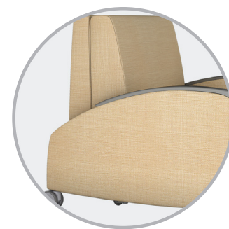
Wall-Saver Design No Damaged Paint or Upholstery