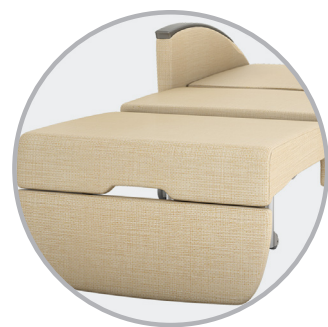
Fewer Moving Parts Minimal Maintenance