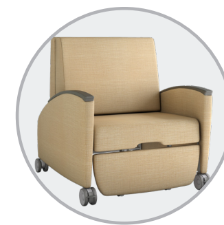
Weight Capacity: 750 lbs. Bariatric-friendly