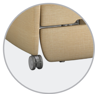
Hospital-Grade Dual Wheel Locking Casters Ease of Movement