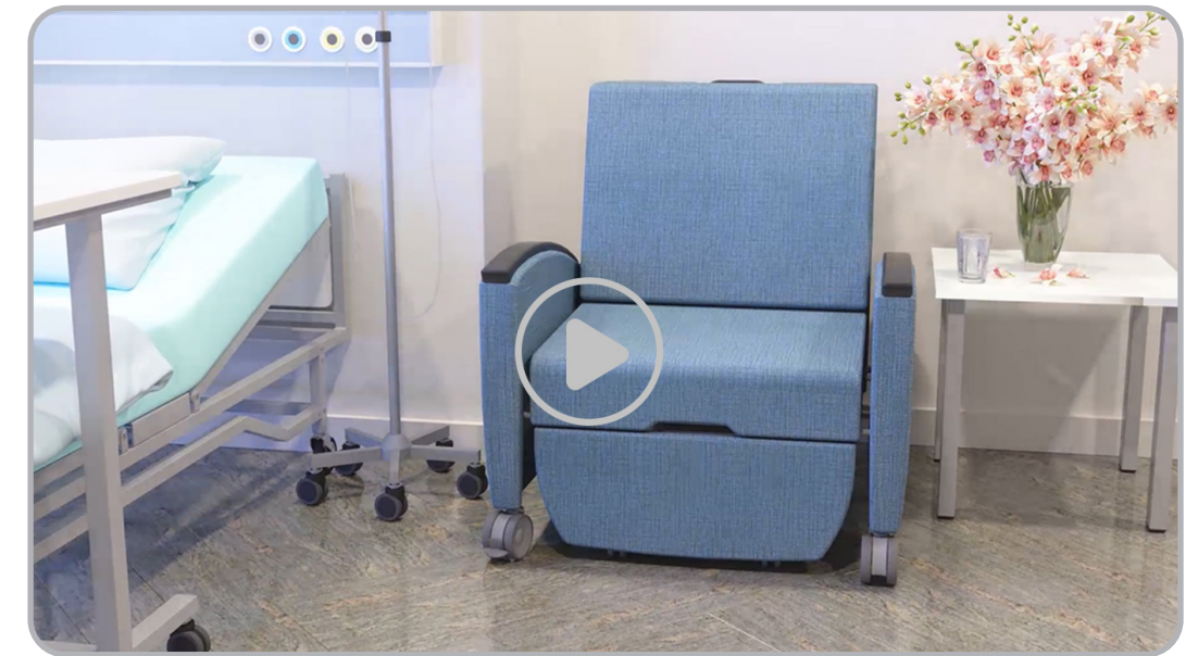
Watch the video to see how easy it is to use