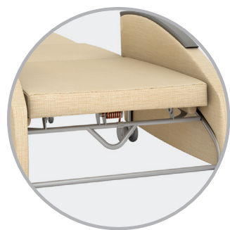
Simple Spring Mechanism Easy to Open and Close