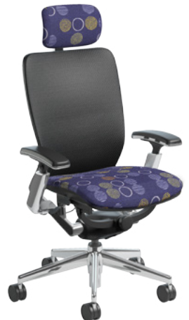
7300D-UFST AMUSE | AMU1 | Admiral