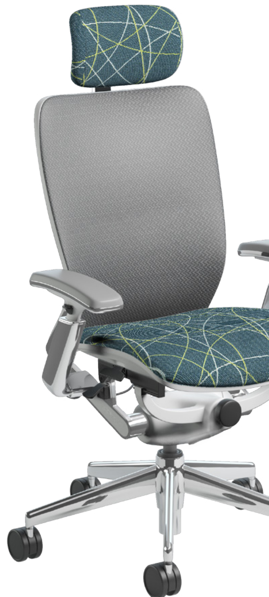
7300D-WHUFST White Frame Upholstered Seat FREE | FREE4 | Oasis