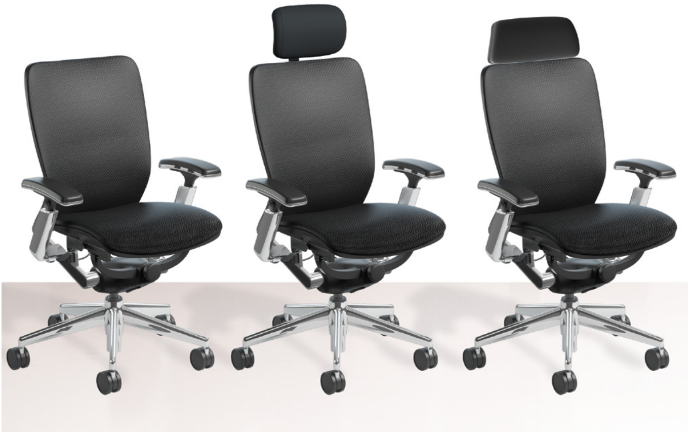
7300 Mid Back

IC2 ® chair series offers a seating choice for the office that combines design, comfort and ergonomic technology that will enhance any modern office. The IC2 ® is available in 3 functional models, Mid Back, Mid Back with Adjustable Headrest and Mid Back with Integrated Headrest.