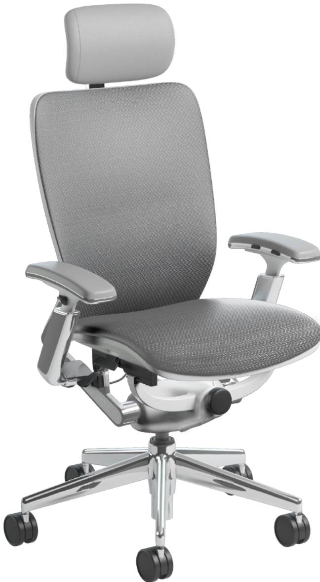
7300D-WH White Frame Standard Silver Nebula Mesh Seat & Back