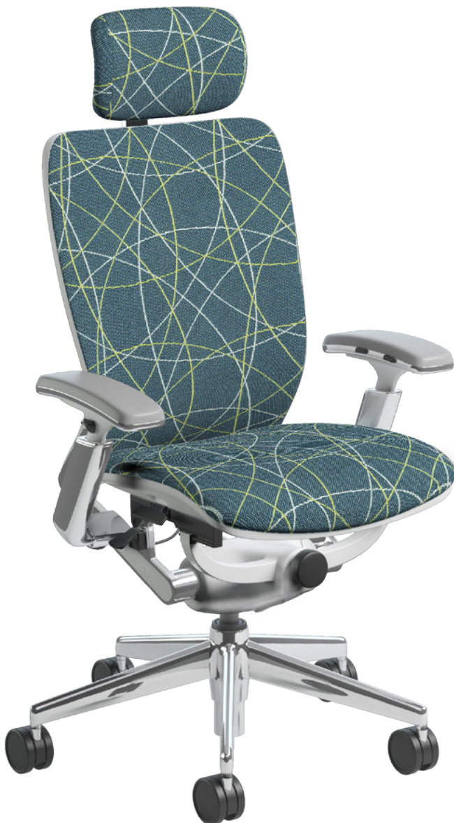
7300D-UF White Frame Upholstered Seat & Back FREE | FREE4 | Oasis