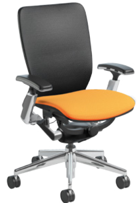
7300-UFST BEEHAVE | BEE01 | Mustard