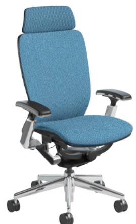
7380-UF MOGULS | M02691 | Waterfall