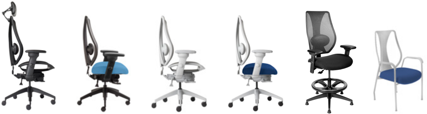
All mesh shown with optional headrest