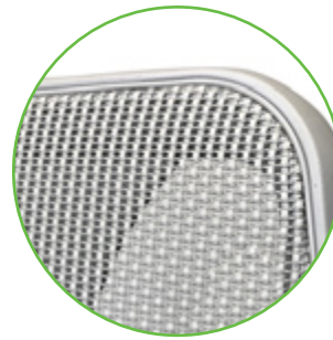
Light Gray mesh and frame

Both the tCentric Hybrid™ seat and backrest are made from elastomeric mesh with fill yarns made from polyester allowing air, body heat and water vapor to pass through. When stretched, this material yields excellent load-bearing properties and resiliency, showing less than 5% load-bearing loss when tested according to BIFMA standards.