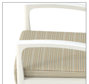
Optional Corian armcaps