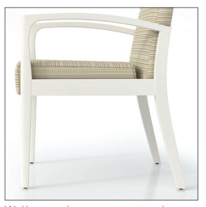
Wall-saver legs on guest and bariatric chairs