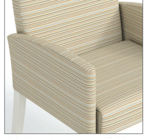
Upholstered armrests available on patient and rocker chairs