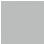
M2 - Silver